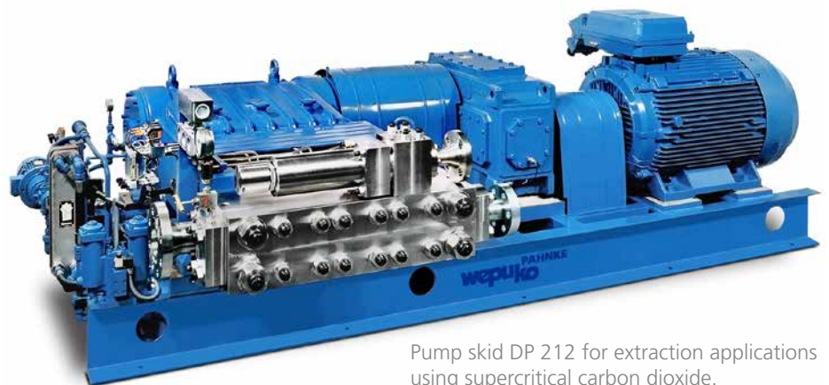
Pump skid DP 212 for extraction applications using supercritical carbon dioxide.