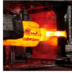
Forging press drives